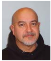
Rhode Island James DiCaprio West Warwick Wastewater West Warwick, RI