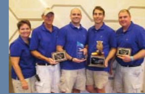
Operations Challenge National Competition