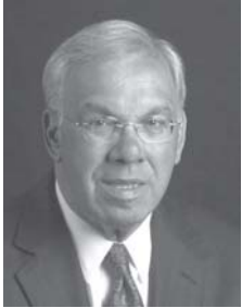
Mayor Thomas Menino

For his significant contribution to the areas of clean water legislation, public policy and government service as Mayor of the City of Boston