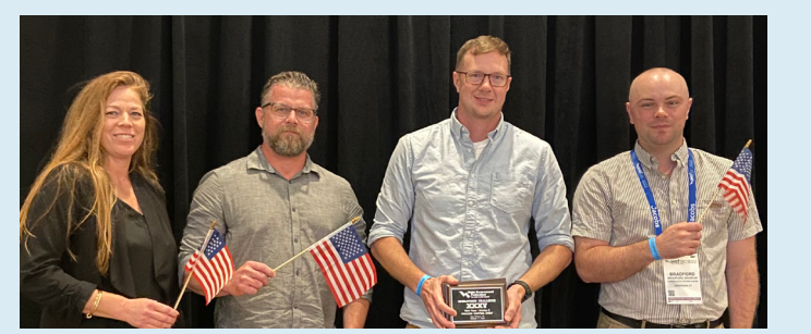
OPERATIONS CHALLENGE DIVISION II 3RD PLACE-PROCESS EVENT* CT Storm Surge