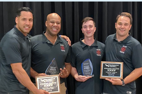
OPERATIONS CHALLENGE DIVISION III 2ND PLACE* MASS Chaos