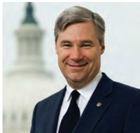
U.S. Senator, Sheldon Whitehouse