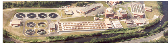
WASTEWATER UTILITY AWARD Waterbury, CT WPC