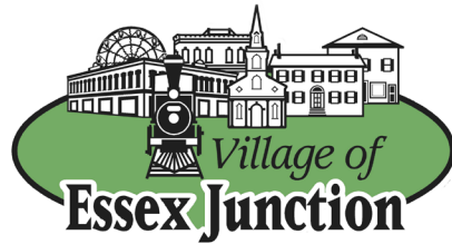
ENERGY MANAGEMENT ACHIEVEMENT AWARD Village of Essex Junction, VT WWTF