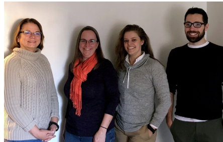
ASSET MANAGEMENT AWARD City of Portland, ME