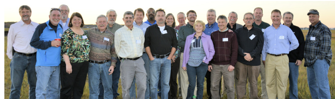
FOUNDERS AWARD New Hampshire Water Pollution Control Association