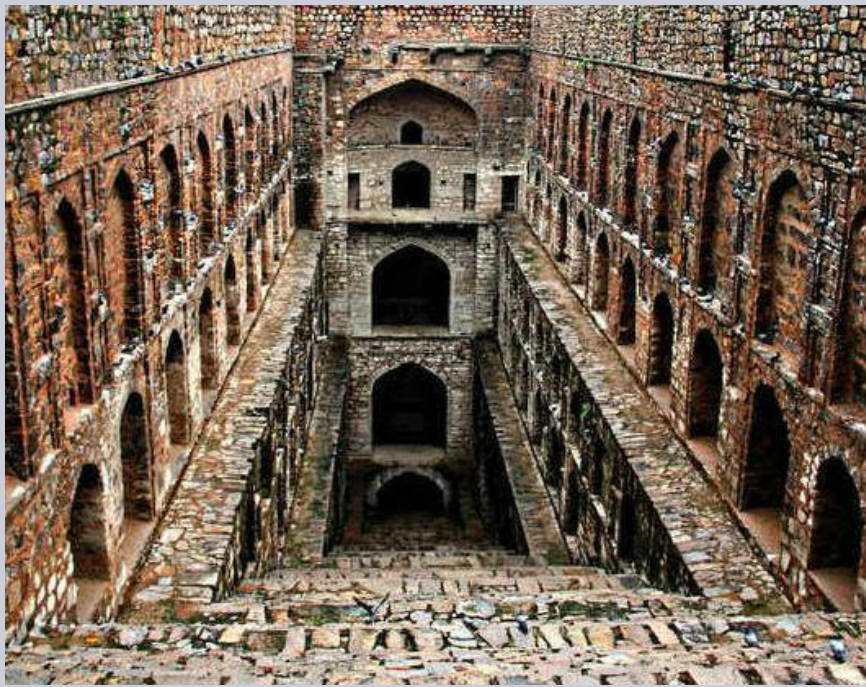
Agrasen Baori- Delhi