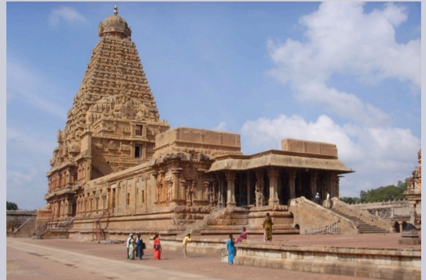
Temple tank- Tamil Nadu