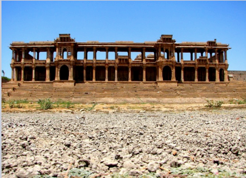
Sarkhej Roza- Gujrat