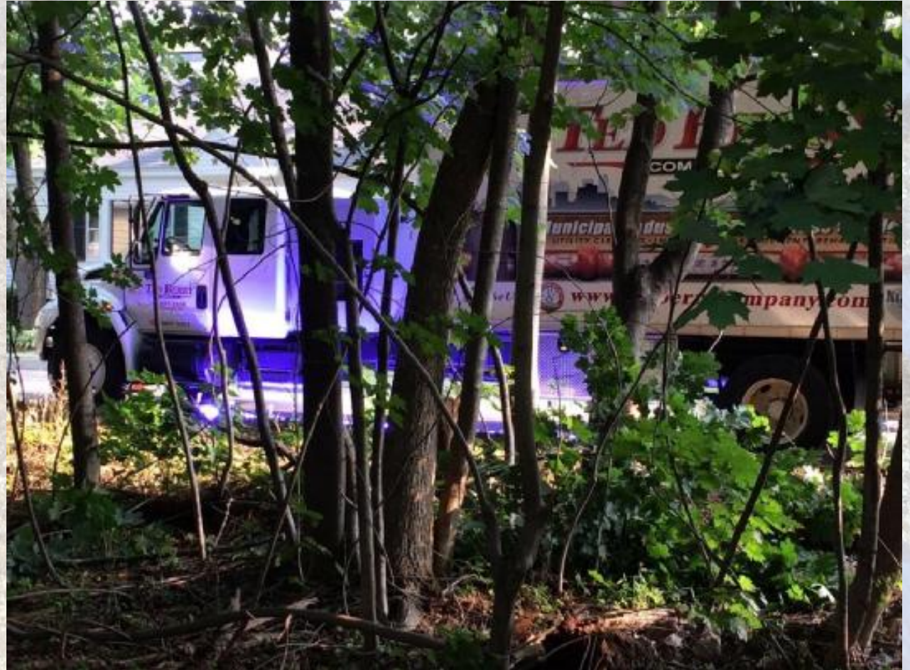
Calibration of UV cure "train"