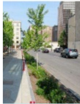
Onondaga Co. "Adopt-A-GI" Project