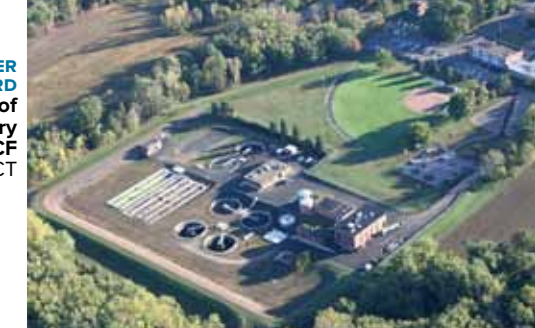
WASTEWATER UTILITY AWARD Town of Glastonbury WPCF Glastonbury, CT