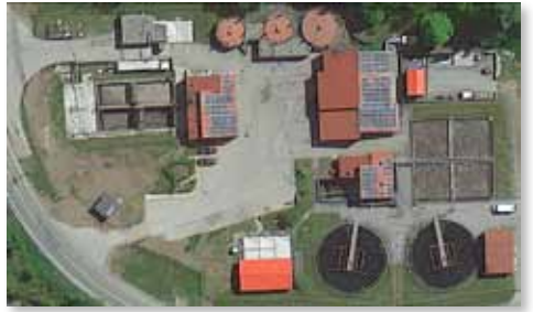
WASTEWATER UTILITY AWARD Water Resources Recovery Facility, Montpelier, VT