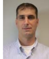
Rhode Island Earl Salisbury Veolia Water N.A. Cranston, RI