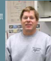
Howard Kimball Village of Essex Junction Essex Junction, VT